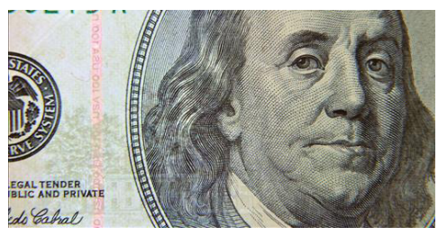
Americans are spending enough to keep the economy rolling, but don't expect them to splurge unless their paychecks start to grow. Neil Shah reports on the News Hub.